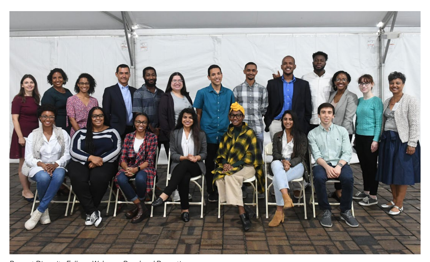
Provost Diversity Fellows Welcome Panel and Reception

The Institute of Human Nutrition distinguishes itself through its strategic use of advertising its current programming and webinars to national and international organizations that have its target demographics, such as the <u>Student National Medical Association (SNMA)</u>. It also reaches out to pre-health advisors, connects with university student groups, and engages with historically underrepresented students through personal outreach.