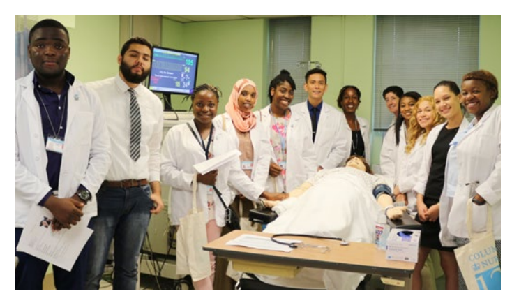
Summer Health Professions Education Program (SHPEP) and MedPrep, Columbia University Pathways Summer Programs

Most students surveyed valued transparency around the fee waiver process. While some were able to take advantage of the waiver when applying to Columbia, others had difficulty accessing or having the waivers approved.