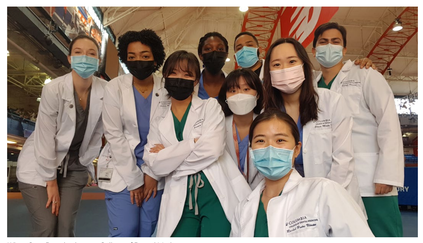
White Coat Day, the Armory, College of Dental Medicine