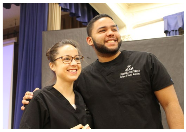
Give Kids A Smile Day Event, College of Dental Medicine