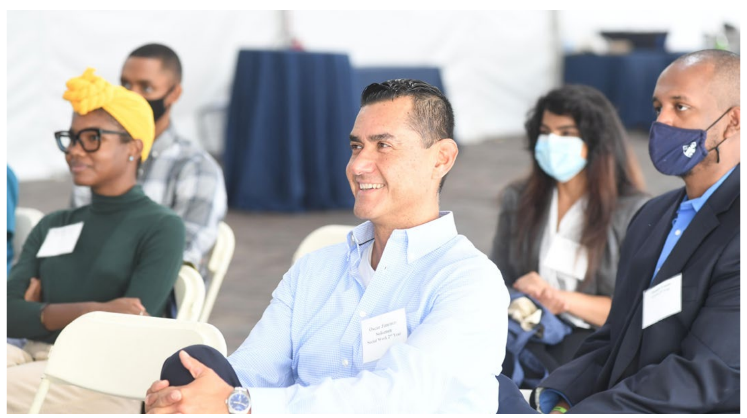
Provost Diversity Fellows Panel

Specific help rooms or departmental tutors are provided directly by the relevant department to assist students seeking extra academic help.