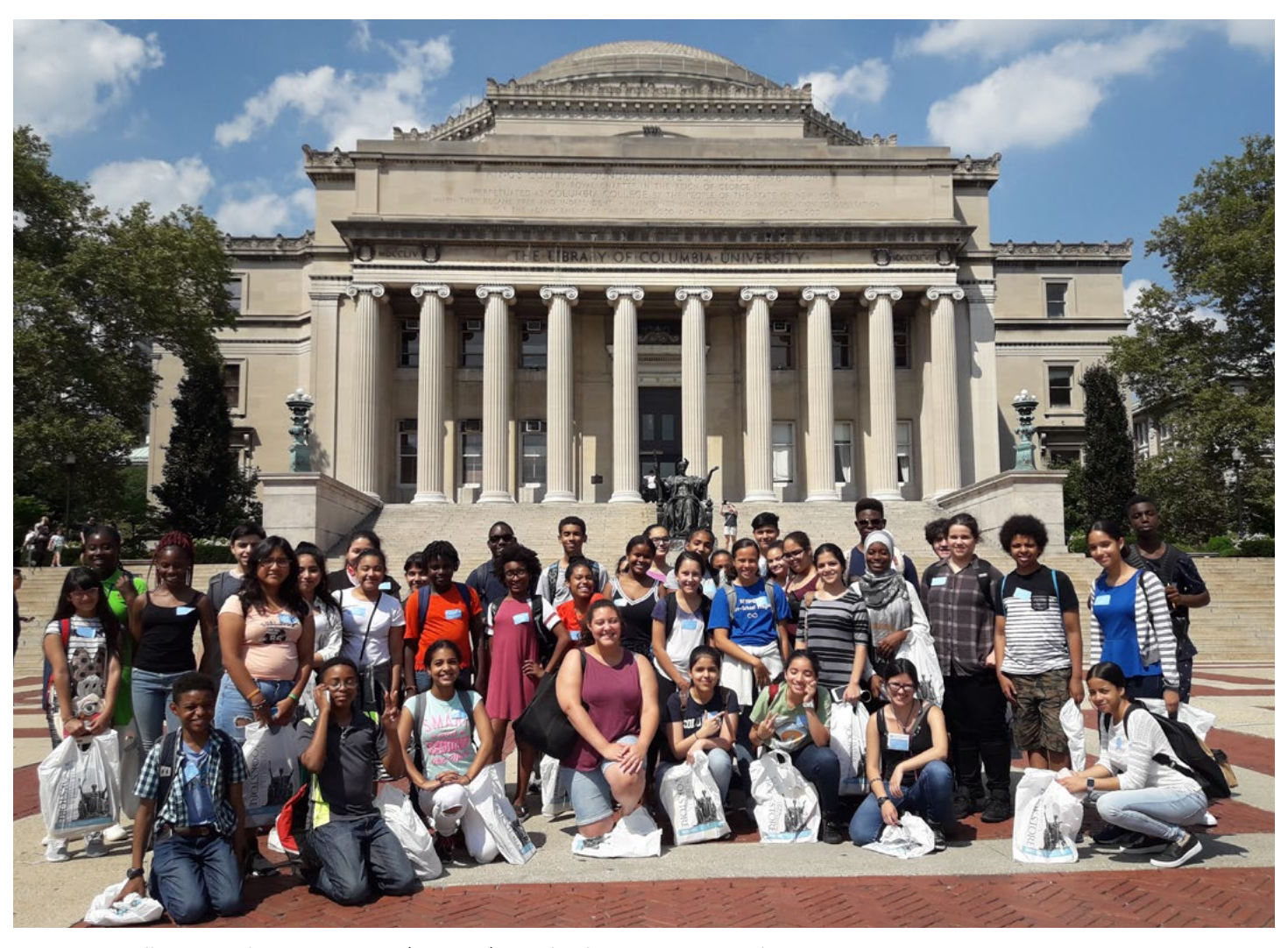
State Pre-College Enrichment Program (S-PREP), a Columbia University Pathways Summer Program