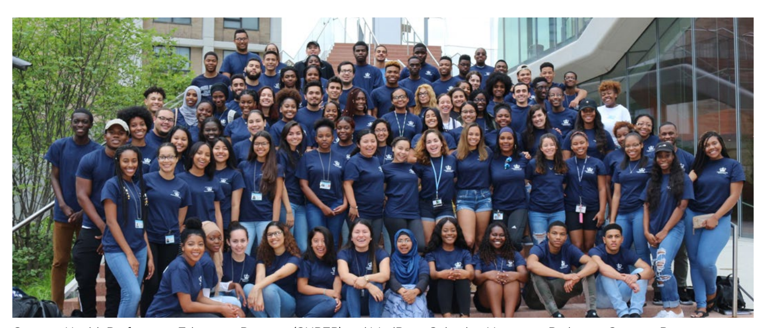
Summer Health Professions Education Program (SHPEP) and MedPrep, Columbia University Pathways Summer Programs

Columbia is home to many <u>pathways programs</u> that serve as a bridge for candidates from historically underrepresented groups to advance from high school to undergraduate studies, undergraduate to graduate studies, graduate studies to