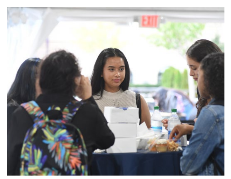
Provost Diversity Fellows Welcome Reception