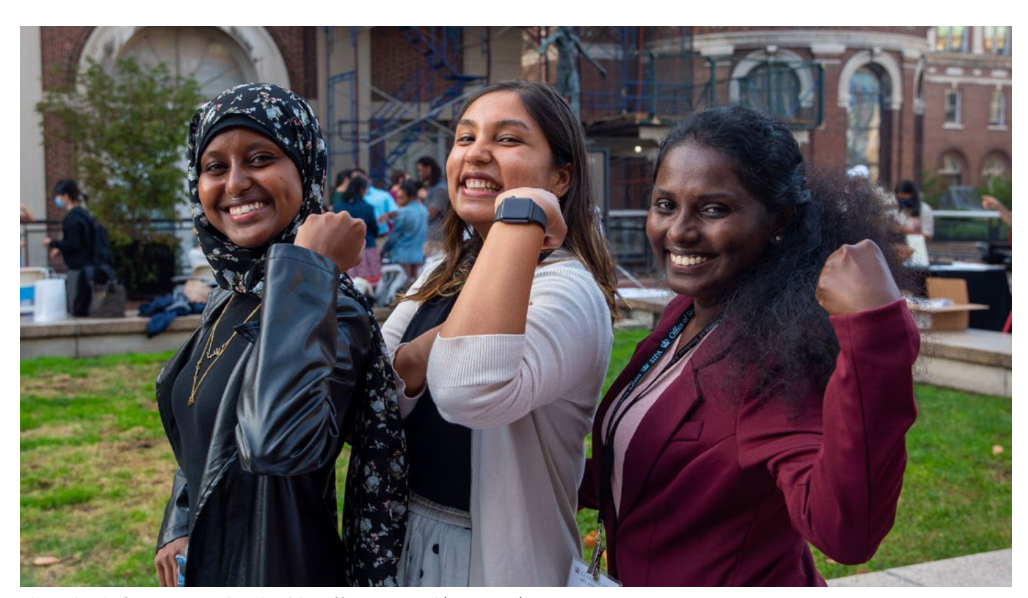
The School of International and Public Affairs Festival (SIPAFest)