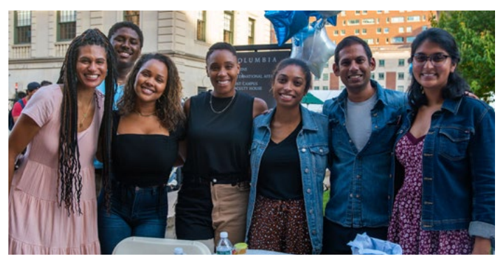
The School of International and Public Affairs Festival (SIPAFest)